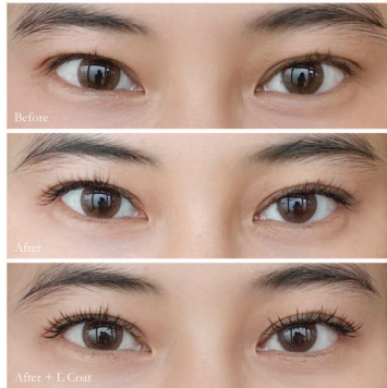
Lash Extension + L COAT